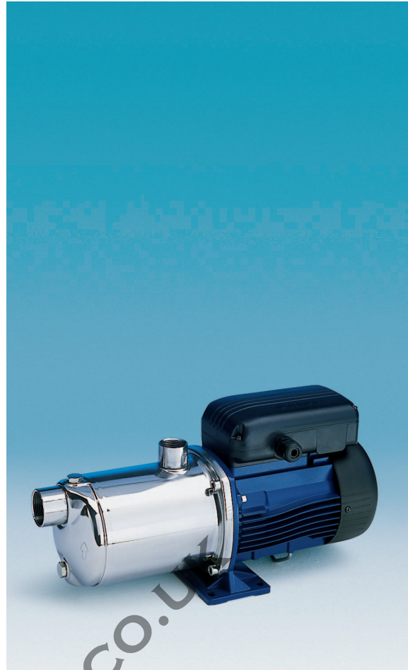
TABLE OF MATERIALS HM SERIES