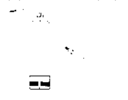
Single phase version with float switch (optional)